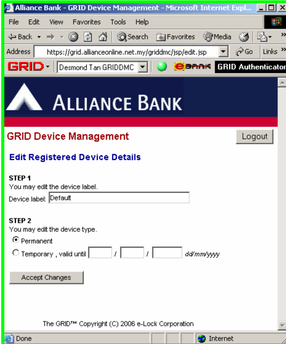
Figure 2.6: Edit Registered Device Page

You may change existing Device label name and Type to Permanent or Temporary at this page. Please note that you will not be able to change a permanent device to temporary device if it is the only Permanent device in your list.